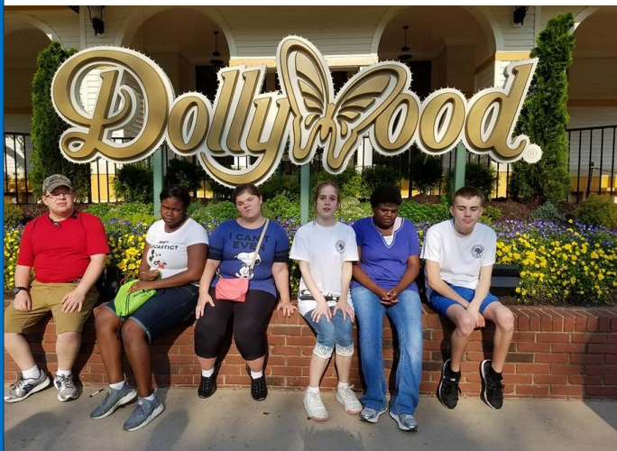
Class of 2017 in Pigeon Forge last week end!

We enjoyed indoor sky diving, zorbing, water park and Dixie Stampede! Thanks to everyone who made our trip possible!