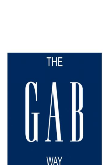
Give it your best Achieve your goals Be respectful